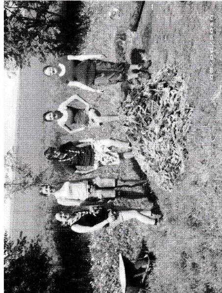
Weeding at Service Camp

This term we have been busy continuing with weekly activities and pub lunches. We have been climbing, going to the cinema, pancake making,