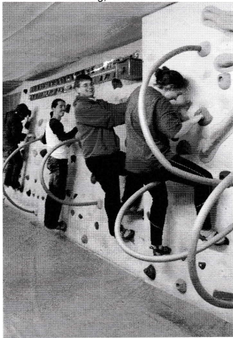
TUGS camp, June 2010